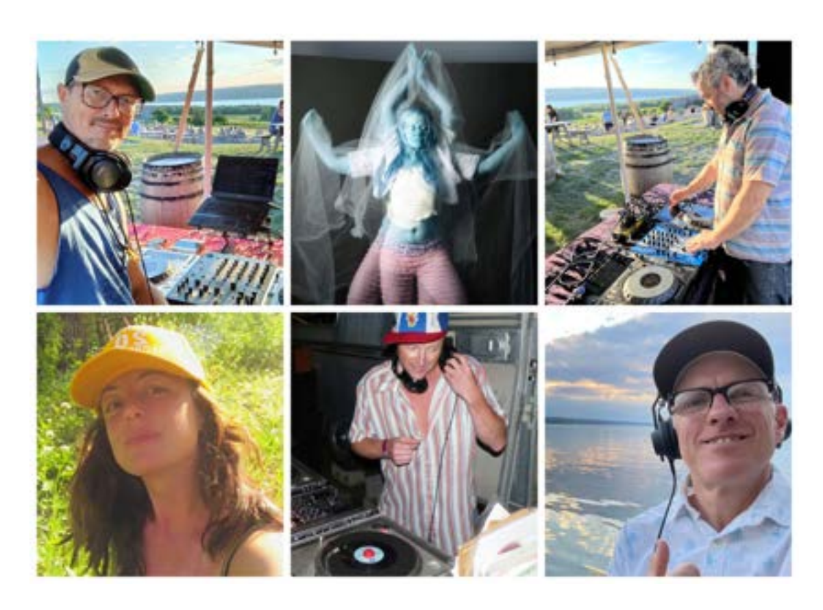
SunSET DJ Series Saturdays, 6:30 - 8:30 p.m.

Groove to the beats of local DJs on select Saturday evenings while savoring wine or cocktails and watching sunsets from the best view on Seneca Lake.