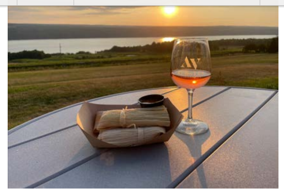
La Monarka at Atwater Saturdays, 2:00 - 7:00 p.m.

Have you been missing La Monarka's food as much as we have? Be sure to save these dates to enjoy the authentic, homemade flavors from their menu, with selections such as flautas, tacos, and more. Vegetarian and vegan options available!